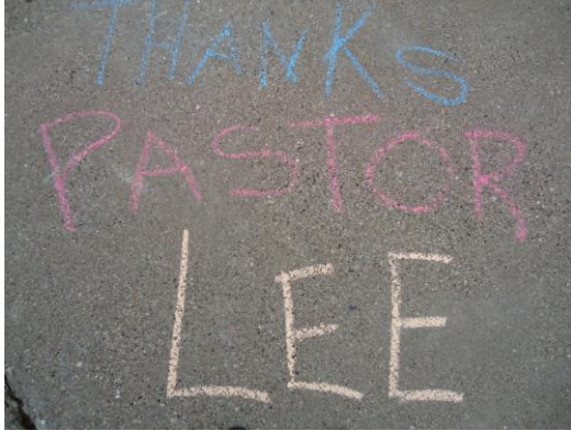
Sunday School says thank you on the sidewalk.