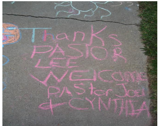
Thank You Sunday School !!!