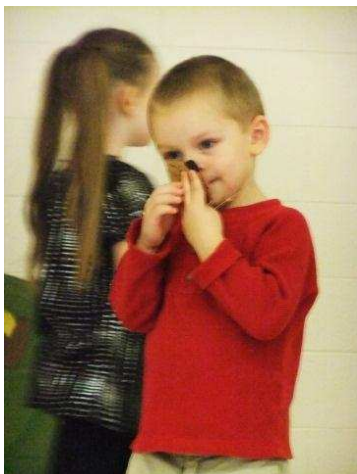
Trenton as a Little Dog who laughed.