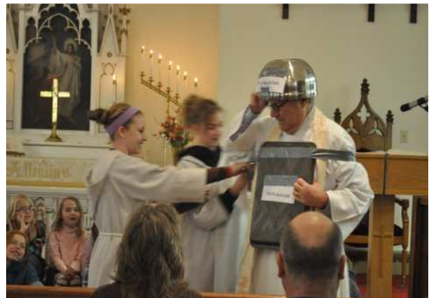
The helmet and the breastplate