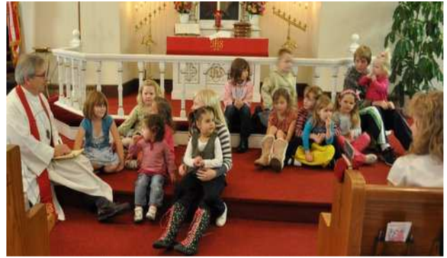
Many things to look at!