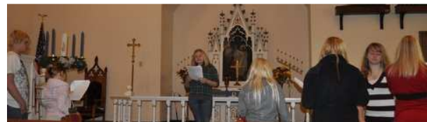
Veronica rapping on the Apostles’ Creed