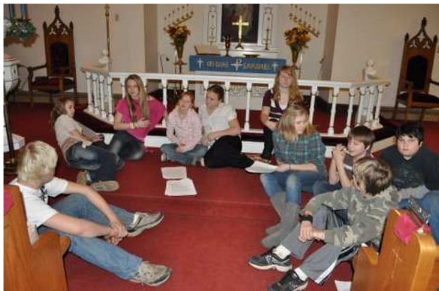
Preparing for an Advent service