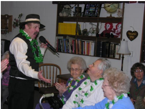
Family Ties St. Patricks Day Bash