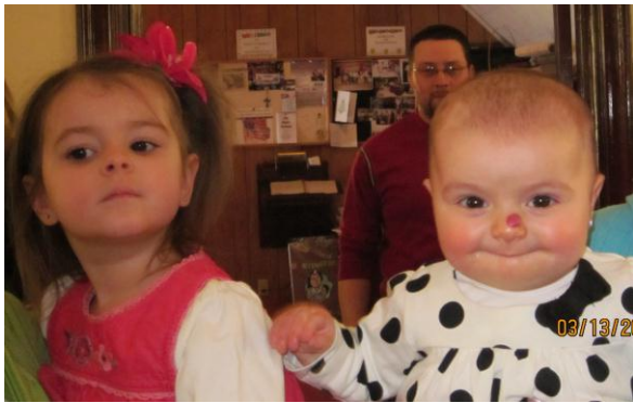
Children in the pews.