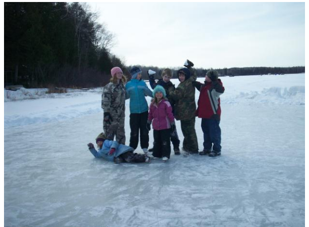
Middle School Youth Siegler's at Six Mile Lake