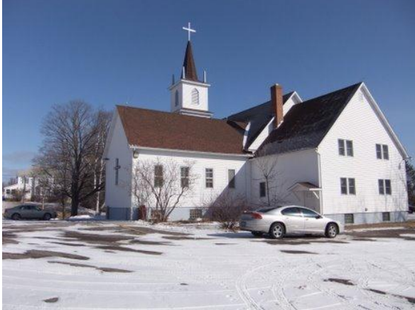
Really! Spring is almost here!